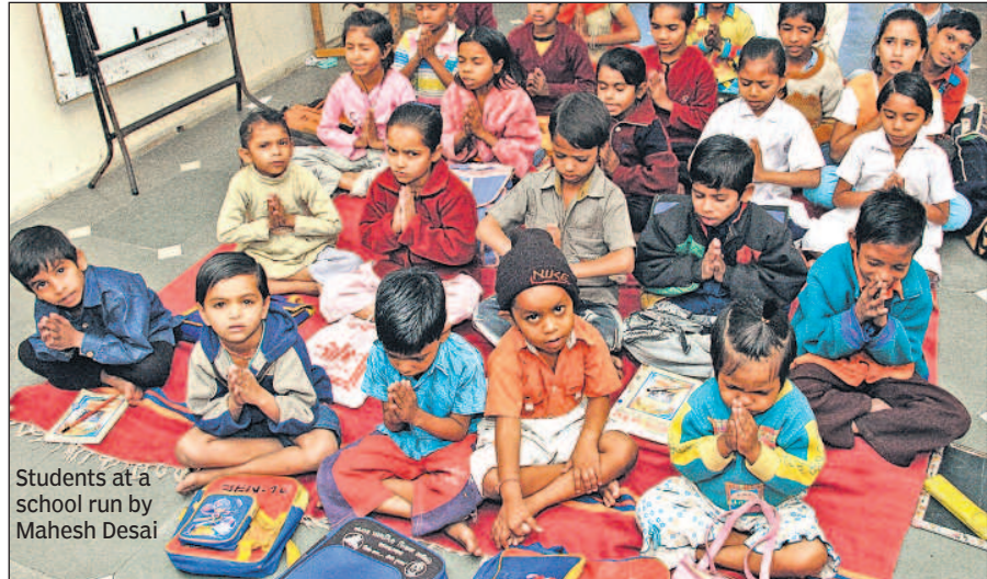
Students at a school run by Mahesh Desai